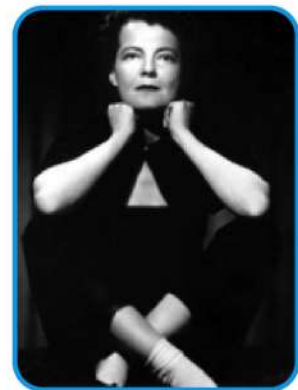
Overall, Margo Jones's legacy is one of innovation, advocacy for new voices, and a commitment to creating meaningful theatrical experiences for both artists and audiences.

Margo Jones, nicknamed the "Texas Tornado", was an American stage director and producer, best known for launching the American regional theatre movement and for introducing the theatre-in-the-round concept in Dallas, Texas. Margo Jones is often credited with coining the term "Theatre of the Imagination." She believed in creating productions that engaged the audience's imagination and emphasized the importance of intimate, immersive experiences in theatre.