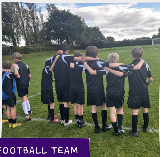
Y9 FOOTBALL TEAM

A big congratulations to our year 9s progressing in the National cup away in Stockport this week.