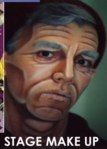
STAGE MAKE UP