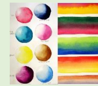
Blending and creating tone with water colour paints.