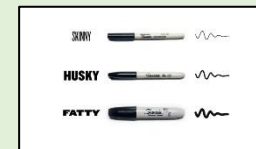
Sharpie and fine line pen to add Emphasis