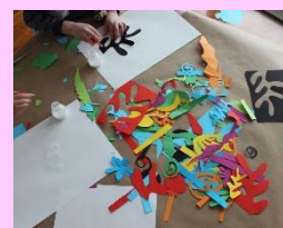
Drawing Techniques: Blending, fine line and sharpie and Cutting Out