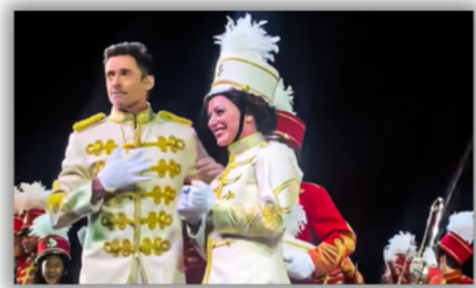
To learn more about how to become an understudy scan the QR code or Click here to be taken to Voytko's websites for all the tricks of the trade!

Here is Voytko with Jackman on that incredible moment of appreciation for understudies and their crucial position in the world of theatre & film.