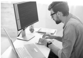
En la foto hay un hombre. Pienso que está trabajando en una oficina. Hay un ordenador y un portátil en la mesa y el hombre me parece muy serio y trabajador. Lleva una camisa u un reloj y también lleva gafas y una barba.

In the photo there is a man. I think that he is working in an office. There is a computer and a laptop on the table and the man seems to be very serious and hardworking. He's wearing a shirt and a watch and he's also wearing glasses and has a beard.