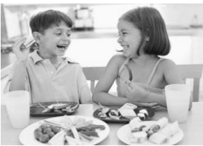
En la foto se ve un chico y una chica. Diría que son muy contentos porque están sonriendo y riendo mucho. Creo que están en una cocina y están comiendo comida sana, los tomates y los pimientos, y están bebiendo agua.

In the photo you can see a boy and a girl. I would say that they are very happy because they are smiling and laughing a lot. I believe that they are in a kitchen and they are eating healthy food, tomatoes and peppers, and they are drinking water.