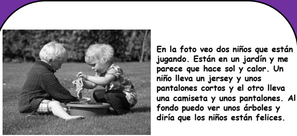
En la foto veo dos niños que están jugando. Están en un jardín y me parece que hace sol y calor. Un niño lleva un jersey y unos pantalones cortos y el otro lleva una camiseta y unos pantalones. Al fondo puedo ver unos árboles y diría que los niños están felices.

You're asked to describe a photo in 2 different exams. Foundation writing exam: You must write 4 short sentences to describe a photo. Start all of these with "hay" (there is) Speaking exam, Foundation + Higher: Say 4 or 5 complex sentences about a photo. Use PALMA to help you remember what to talk about.