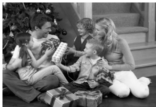
En la foto puedo ver una familia muy feliz. Hay un hombre y una mujer y tres niños. Hay muchos regalos y creo que es navidad porque al fondo hay un árbol de navidad. Las personas están riendo y sonriendo.

In the photo there is a man. I think that he is working in an office. There is a computer and a laptop on the table and the man seems to be very serious and hardworking. He's wearing a shirt and a watch and he's also wearing glasses and has a beard.